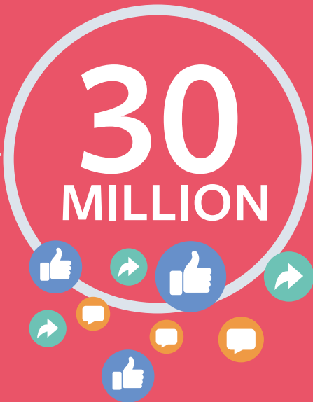
Over 30 million interactions