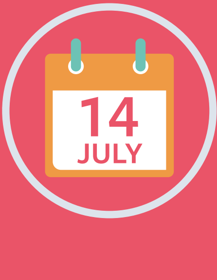
Most engagements: 14th July