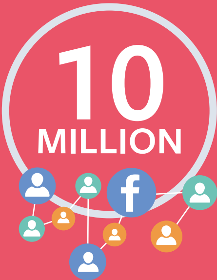
10 million people globally connected

More than 10 million people globally connected on Facebook around AFCON 2019 since the championship began generating over 30 million interactions (likes, reactions, comments, replies, shares). The day that got most people engaged on Facebook so far was 14th of July, the day of the semi finals .