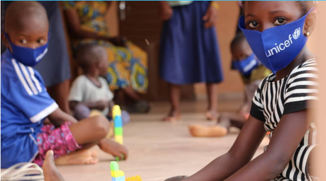
A young girl plays in the safe space put in place for children in the Gogounou municipality, Alibori department