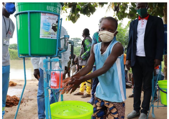
A child washes his hands in the village of Avinouhoué, bordering Togo, using a handwashing device provided by UNICEF

COVID-19 prevention activities are combined with cholera outbreak prevention in the 4 most at risk regions. To this end, 135 additional leaders and community frontline workers received capacity-building on cholera and COVID-19 infection prevention. 70 hygienists were trained on disinfection. In these same regions, UNICEF supported the distribution of water purification tablets and the promotion of household water treatment. 3,449 wells were disinfected. As a result, UNICEF sustained access to safe water for 41,918 people . UNICEF continues its efforts to guarantee access to WASH service for vulnerable children and their family. 2,147 new household handwashing devices (tippy tap) were set up in partnerships with targeted municipalities, regional directorates for sanitation and NGOs. These efforts enabled 17,667 households to practice handwashing to prevent the transmission of COVID-19. To this day, 389,776 people benefited from critical WASH supply and services .