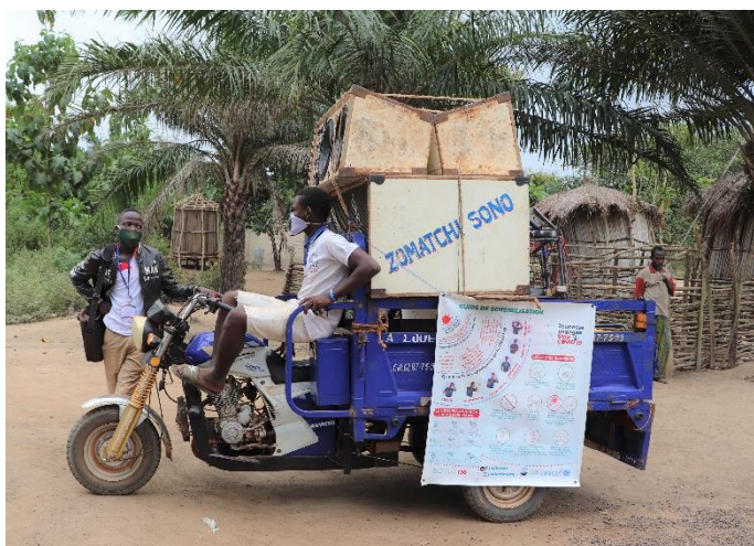
Sensitization caravans are used to inform communities on COVID-19 in Lokossa

During the reporting period, 1,024 relays were trained, amounting to a total of 4,256 community relay trained . In the Borgou department, 4 surveillance committees with 63 people were set up. In the Zou department, 430 local leaders were trained to establish similar surveillance committees and 25 women groups started community awareness-raising sessions. Awareness-raising and advocacy meetings among 335 traditional leaders, religious leaders, traditional healers and political and administrative leaders were organized.