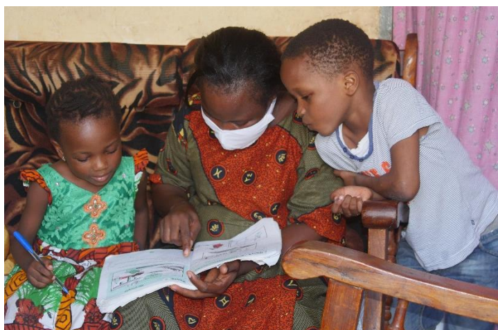
A mother reads school lessons for her children in Cotonou

Following the reopening of primary schools, and as the lead of the COVID-19 local education group, UNICEF continues to advocate for the respect of prevention measures in schools and access to protective masks for all students and teachers. The Country Office visited several schools in the Northern part of Benin to monitor school reopening and sensitize communities on the importance of education. UNICEF distributed handwashing stations to 2,847 schools. UNICEF provided handwashing equipment to 452 primary school examination centres, benefiting 141,503 students . The Government's proposal to the Global Partnership for Education on supporting response and early recovery of the education sector in response to COVID-19 was approved for a total of USD$ 7 million.