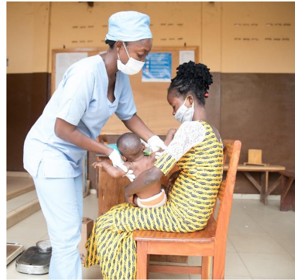
A nurse assists a mother during a nutrition consultation in Bohicon

8,166 children received psychosocial support