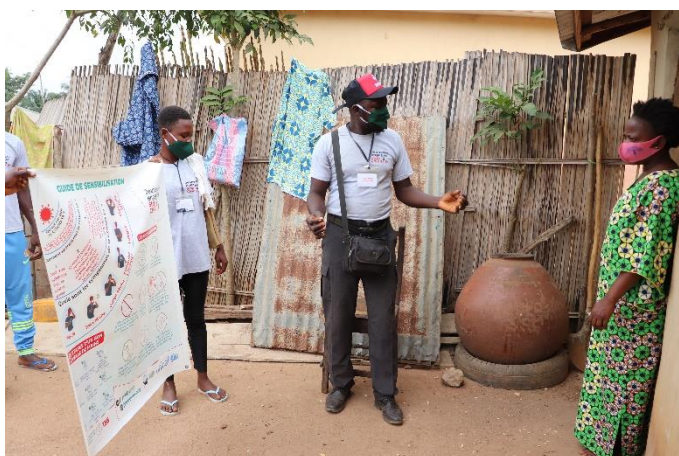
Door-to-door campaign led by a dozen young volunteers in Ouedeme Adja

During the reporting period, 139,225 people took part and engaged in home visits and group discussions, amounting to a cumulative total of 610,779 people reached . These efforts are led by 270 young NGO workers, in partnership with 760 community leaders. After the reopening of classes, young volunteers organized sensitization sessions in schools in the Mono Department, reaching more than 200 primary school students. They also supported women's associations in producing local mask, set up handwashing devices in public places and monitored respect of COVID-19 protection measures with local authorities in six cities. Based on feedbacks collected, young volunteers reinforced sensitization efforts with families and identified priority needs and concerns, which were then shared with relevant authorities. In the last two weeks, 20,784 people shared their concerns and asked questions/clarifications about COVID-19 .