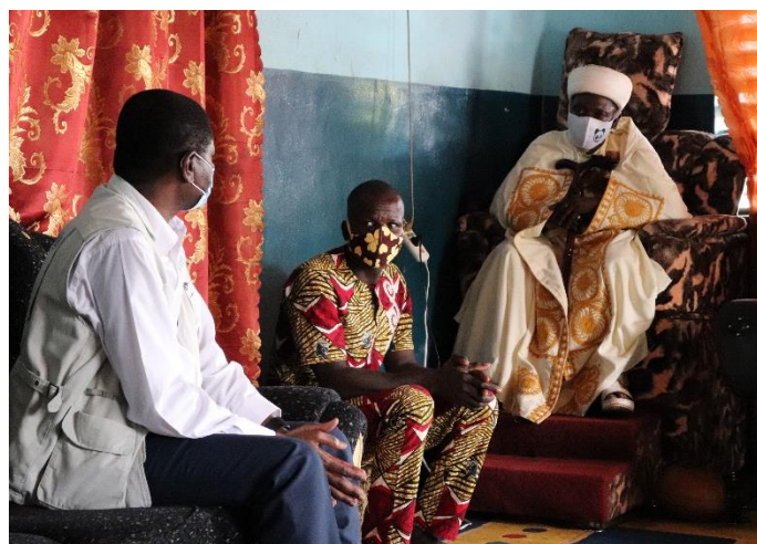
UNICEF Representative discusses child marriage during COVID-19 with the King of Parakou and imams from Parakou Central Mosque

To date, 8,166 children (599 new girls and 673 new boys) adults (358 new women and 372 new men) received psychosocial support . During the reporting period, 209 new children (160 girls and 49 boys) benefited from a package of integrated services (legal, social, health), including psychosocial support, amounting to a total of 917 children.