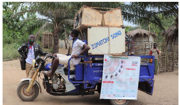
Sensitization caravans are used to inform communities on COVID-19 in Lokossa

During the reporting period, 4 surveillance committees with 63 people were set up in the Borgou department. In the Zou department, 430 local leaders were trained to establish similar surveillance committees and 25 women groups started community awareness-raising sessions. Awareness-raising and advocacy meetings among 335 traditional leaders, religious leaders, traditional healers and political and administrative leaders were organized