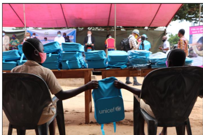
UNICEF supported the back to school campaign by providing school supplies to 214,071 children including 100,943 girls

providing handwashing equipment, and others material (hand sanitizer, sensitization material). UNICEF with support of its partners, especially Swiss Cooperation, EDUCO, Plan International and World Bank through Global Partnership for Education Funds had supported the back to school campaign and provided school supplies to 214,071 children including 100,943 girls enrolled in grade 1 and grade 2 in primary school and to 32,672 adolescents girls of grade 1 and grade 2 in lower secondary schools in vulnerable districts so as to facilitate their access to school and their retention. This will be extended to other districts with the financial support of the Global Partnership for Education.