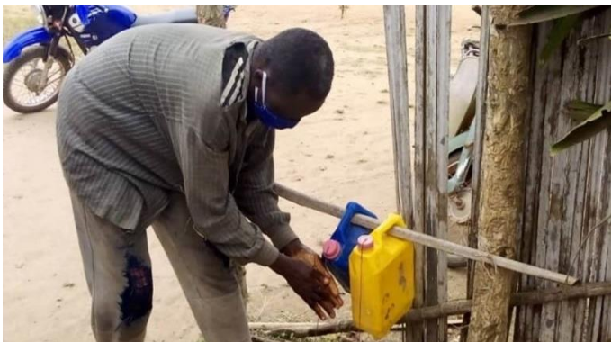
Demonstration of hand washing

During this period, awareness raising sessions around preventive measures application covering hand hygiene, mask wearing and other COVID-19 hygiene protocols including household water treatment promotion was strengthened in markets, schools, health Centre, in communities to avoid slackening of these practices. At least 36,920 additional women learned how to practice water treatment and received water purification tablets. A total of 8302 wells were disinfected. UNICEF sustained access to safe water for 96,094 people. To date, 465,418 people benefited from critical WASH supply and services. As part of school re-opening, a visit to a sample of schools in the Ouémé region showed a diverse application of prevention measures. The majority of schools had handwashing facilities, but number is not enough and often not used, temperature screening is not done and the wearing of the mask is not generalized. It will be necessary to strengthen sensitization and supervision in these schools and encourage the government to take necessary actions to be able to meet the norms and standards of schools reopening. To support the reopening- norms and standards compliance, UNICEF, is in the process of developing a best appropriate and innovative -model of handwashing devices for schools that don't have access to handwashing services-.