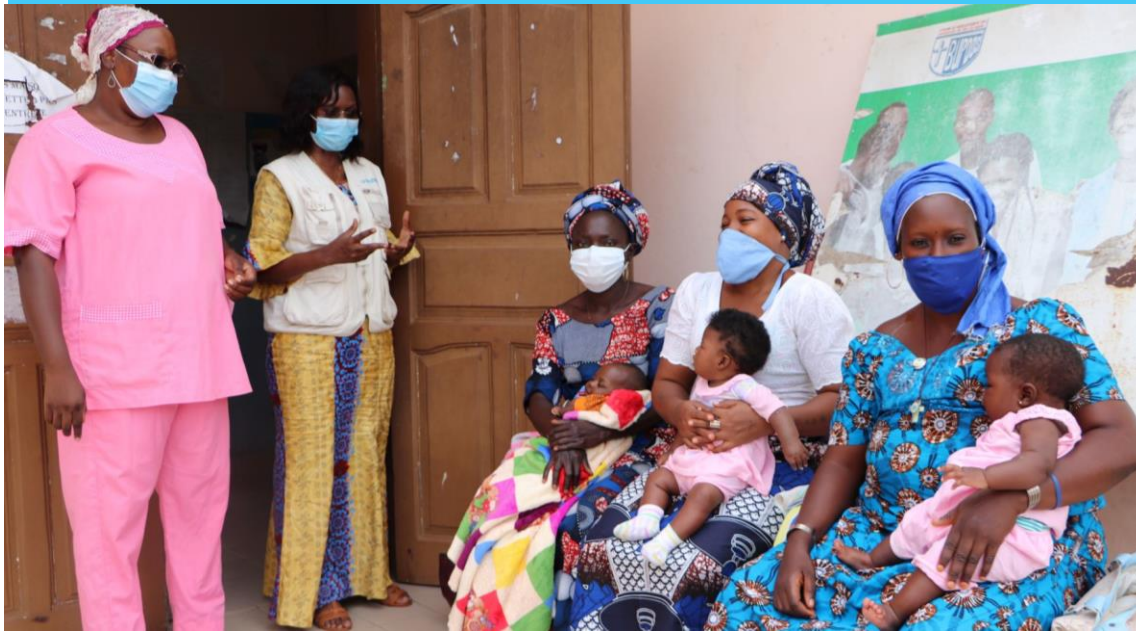
In So-Ava, UNICEF Staff and midwife talking about Covid-19 to mothers