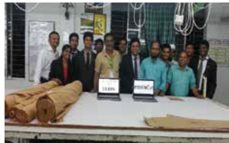
Bangladesh (Bottom Wear)