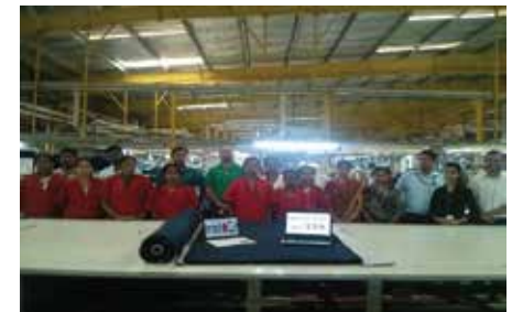
India (Ladies Tops)