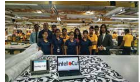
Sri Lanka (Active Wear)