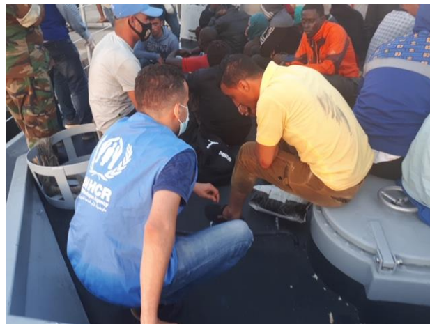
UNHCR at the Tripoli Naval Base during the disembarkation of refugees and migrants rescued/intercepted at sea.

As of 13 August, 6,971 refugees and migrants have been registered as rescued/intercepted at sea by the Libyan Coast Guard and disembarked in Libya. So far this year, a total of 2,173 persons of concern to UNHCR disembarked in Libya mainly from Sudan (76 per cent) and Somalia (10 per cent). Between 10 & 13 August, more than 200 individuals disembarked at the Tripoli Naval Base, Al Khums, and Zwara. UNHCR and its partner, the International Rescue Committee (IRC), were present at the disembarkation points to provide urgent medical assistance and core relief items (CRIs) before individuals are transferred to detention centres by the Libyan authorities.