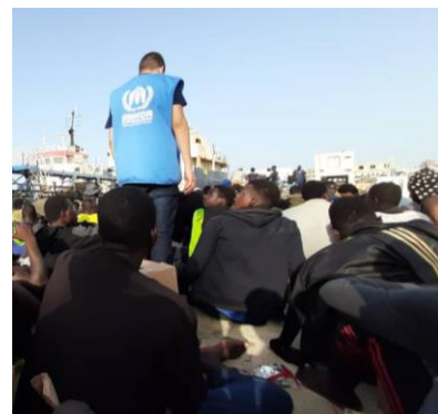
UNHCR at the Tripoli Naval Base during disembarkation.

As of 23 September, 8,247 refugees and migrants have been registered as rescued/intercepted at sea by the Libyan Coast Guard (LCG) and disembarked in Libya. On 21 September, some 91 individuals mainly from Sudan disembarked at the Tripoli Naval Base. UNHCR and its partner, the International Rescue Committee (IRC), continue to be present at the disembarkation points to provide urgent medical assistance and core relief items (CRIs) before individuals are transferred to detention centres by the Libyan authorities.