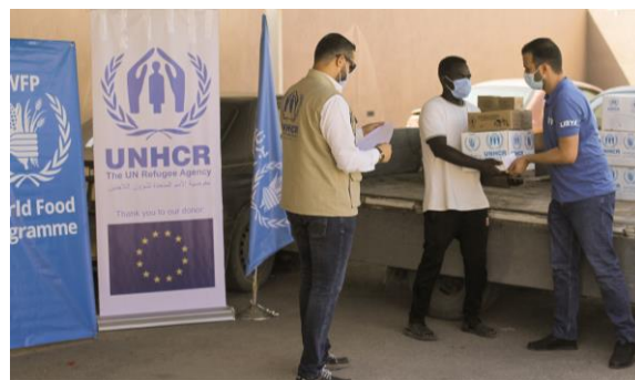
Joint distribution by UNHCR and WFP of food parcels in Zawiya.

Last week, UNHCR and the World Food Programme (WFP) conducted the distribution of food assistance to refugee and asylum-seeker populations in Misrata (190 km east of Tripoli), Al-Zawiya (45 km west of Tripoli) and Zwara (100 km west of Tripoli). Movement restrictions and curfews related to COVID-19 have made it difficult for people to find daily work, while food prices have also sharply risen, making it hard for families to feed themselves. Last week, more than 2,200 food-insecure refugees and asylum-seekers received food packages. Since the beginning of the year, a total of 9,600 internally displaced persons, refugees and asylum-seekers have received food assistance.