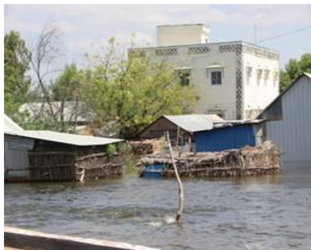
Flooding in Belet Weyne town