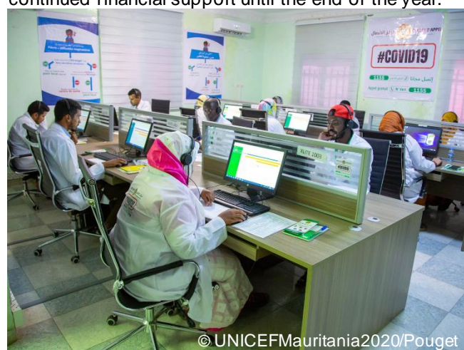
The 1155 toll-free call centre

The lift of the restrictions on movement between regions and of the curfew, led to non-compliance with barrier gestures and a very low level of alerts (-50% of alerts for the call centre). A rapid assessment is being carried out to determine the causes of the drop-in alerts. A mini campaign under the theme "responsible deconfinement" was undertaken in collaboration with the Ministry of Health. The aim of this campaign is to insist on the existence of the disease and the need to protect oneself and others, especially the most fragile (with emphasis on the holiday season). The 1155 toll-free call centre continues to operate. More than 1,339,000 calls have been received by the centre since it opened. Funding has so far been provided by UNICEF. The Minister of Health has requested continued financial support until the end of the year.