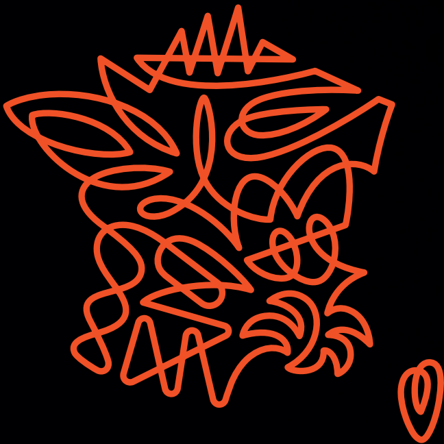
A BALL THAT DRAWS ITS INSPIRATION FROM THE FRENCH TERRITORIES and which honours the 10 host cities, each one represented by a unique symbol depicted on its sides.