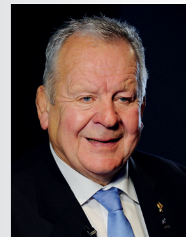
SIR BILL BEAUMONT, WORLD RUGBY CHAIRMAN

Today, we mark two years to go until Rugby World Cup 2023 in France and anticipate an event that will demonstrate the unifying power of sport on and off the field, a fitting celebration of rugby, its values and France in the 200th year of the sport.