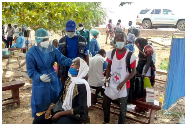
Kousséri: COVID-19 tests being administered to students who returned from writing the Chadian Baccalaureate.